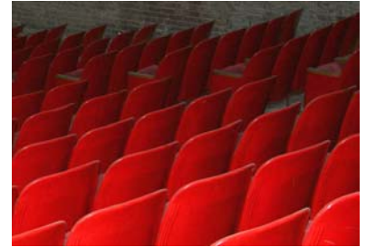
The Colonial Fox Theatre has 804 useable seats. Each seat would need 1 1/2 yards of fabric to refurbish.

We would like to expand the Foundation Board of Directors, so if you are interested, or would like to recommend someone, please call or email us and let us know. The time commitment is to attend board meetings and take on special projects as needed. We are especially looking for board members with fundraising experience, financial and/or tax accounting or structural engineering backgrounds.